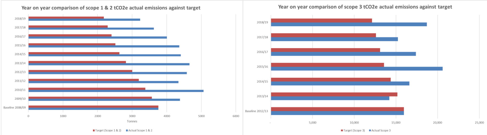
Figure 1: The graphs above show the university total carbon footprint broken down between direct (scope 1 & 2) and indirect (scope 3) carbon emissions. Year on year comparison of carbon emission targets against our actual absolute emissions.