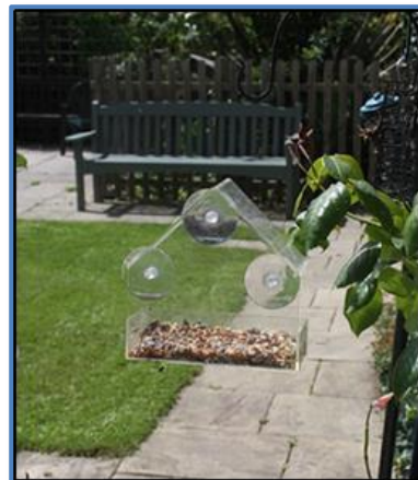
Bird feeder on outside of window to enable bird viewing from indoors.

The only negative impact of engaging with nature found in the literature, survey and case studies related to self-identity or the sense of self: the confirmation of self that can be gained from carrying out nature-based activities can be a negative experience when people living with dementia discover that they are no longer able to carry out activities they used to enjoy.