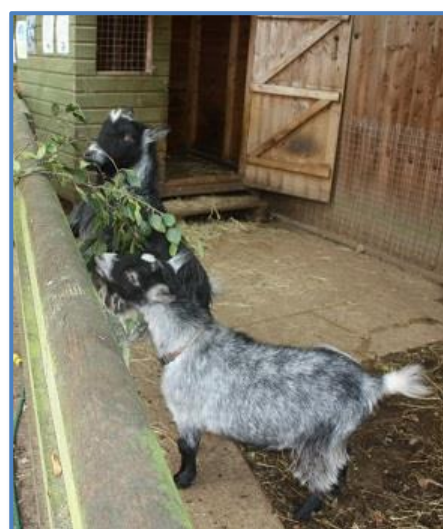
Goats at a care home pet farm