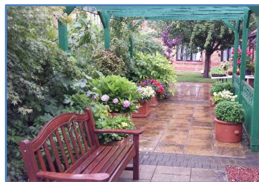
Outdoor paths at extra care housing scheme

The existing evidence on health and wellbeing outcomes of engaging with the natural environment for people living with dementia is very limited and fragmented and there is a need for more rigorous research in the area. Furthermore, research on this topic that focuses specifically on accommodation and care settings is even more limited. There is also a lack of consistency in the tools and measures used to assess wellbeing outcomes. Nevertheless, there is some emerging evidence in the literature suggesting that engaging with the natural environment has beneficial health and