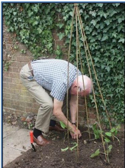
Care home resident planting beans

I love walking, Love walking. Always have done.