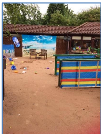
Artificial beach at care home