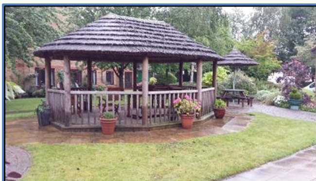
Covered outdoor area at extra care housing scheme

There are numerous ways in which people with dementia can connect with nature in these settings, such as gardens and gardening, horticultural therapy / therapeutic horticulture, care of indoor plants, walking in nature, green exercise, animal assisted therapy and nature-based arts and crafts.