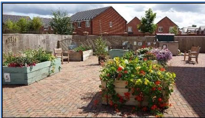
Raised flower beds at Extra Care housing scheme