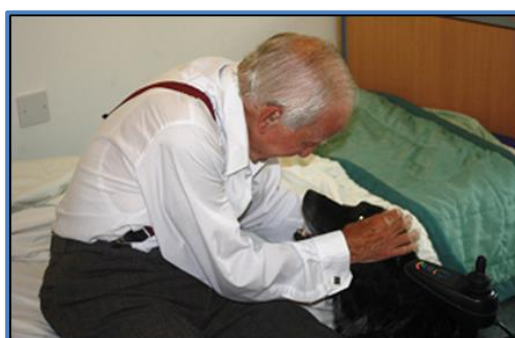
Care home resident with PAT dog