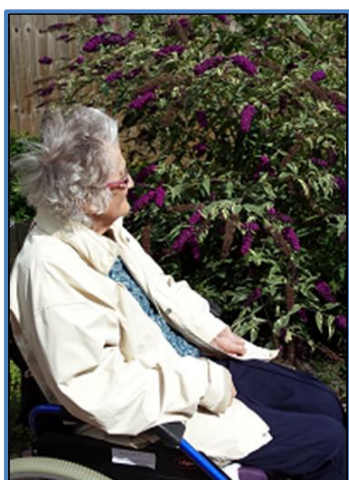
Extra Care housing resident in the garden

Oh, yes, yes. I like to get out. I've always done a lot of fishing. Not sea, I've done sea fishing, but I've also done river fishing. And that gets you into the fresh air and into the country. Because I'm a Brummy, I like to get into a bit of country.