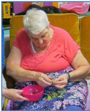
Care home resident shelling peas

There is evidence in the literature and some evidence from the staff interviews at the case study sites that the benefits of engaging with nature may be sustained for hours or for the rest of the day, for example, in terms of reduced agitation for the rest of the day or improved sleep that night. Longer-term effects are difficult to establish scientifically for people living with dementia due to the fluctuating and progressive nature of the disease. The attitude of several of the staff interviewees was that an activity is a success if the resident had enjoyed it at the time and it had contributed towards them having a good day – it was a positive outcome if the resident had engaged in meaningful activity, experienced pleasure while doing so and was happy and calm that day as a result.