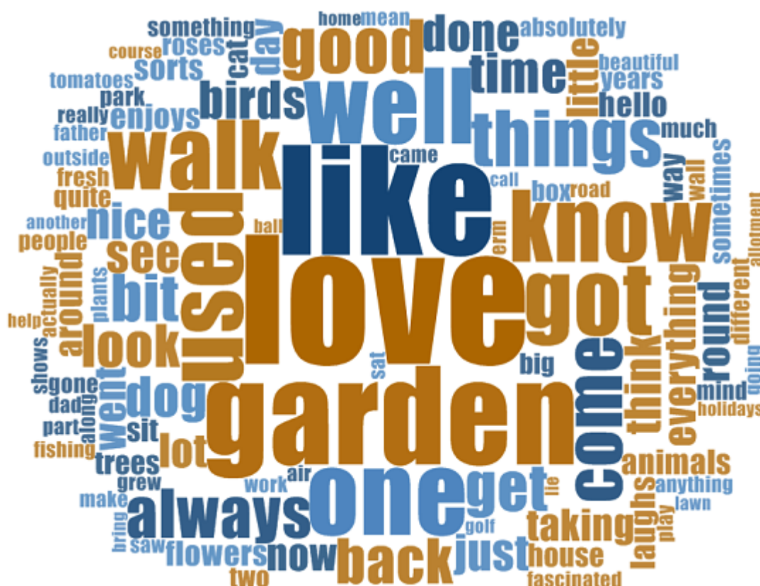
Figure 1: word cloud of the 100 most frequently used words by residents living with dementia when talking about their experience with nature and how it makes them feel (Note: 'yes' was removed from the analysis as this was very frequently used at the start of a quote in response to a question from the interviewer).

All of the relevant residents' quotes relating to their past experience with nature, nature-based activities they are currently engage in, their reasons for engaging in them and how engaging makes them feel were collated in a qualitative data analysis software package and a word cloud of the 100 most frequently used words was created (see Figure 1).