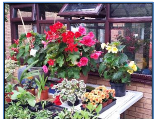
Potting table at Extra Care housing scheme