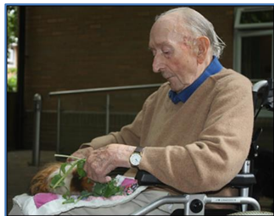
Care home resident feeding guinea pig