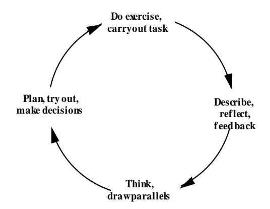
Experiential Learning Cycle

This cycle, or learning sequence, has the underlying premise that learners learn best when they are active, take responsibility for their own learning, and can relate and apply it to their own context. Critical reflection plays a key role throughout the course and participants are encouraged to become a reflective practitioner, where they will explore the scholarship of learning and teaching in HE; synthesise, explain, make sense of and ultimately develop meaning from, teaching experiences.